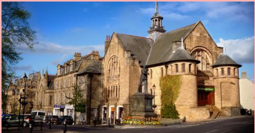
Hexham Community Church

UCAN seeks to promote and encourage other groups that organise Church Administrator days including national church groupings. We seek to arrange our own programme (for training and networking) not to clash with these.